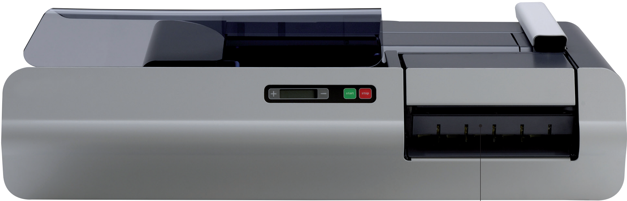
Fully automatic contents extraction on IM-35