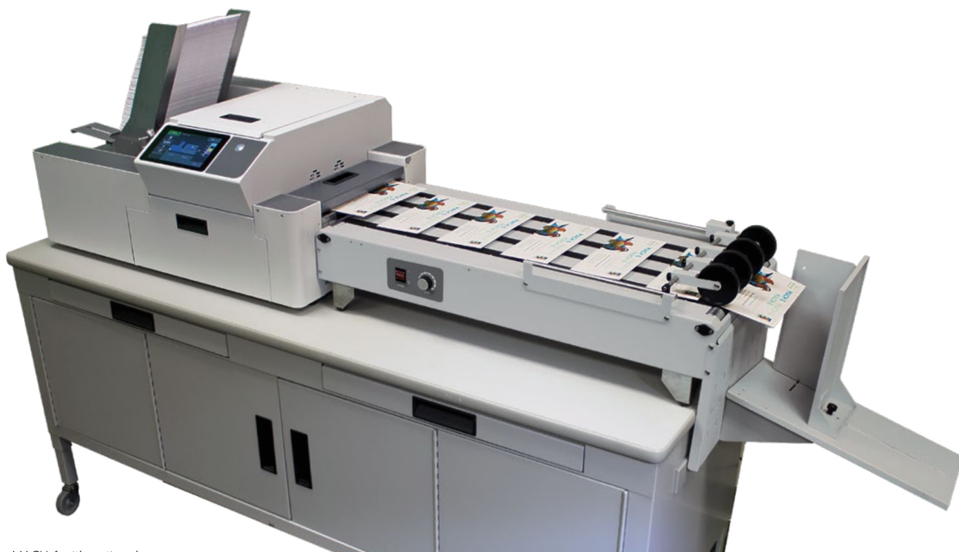
MACH 6 with optional conveyor stacker & cabinet base