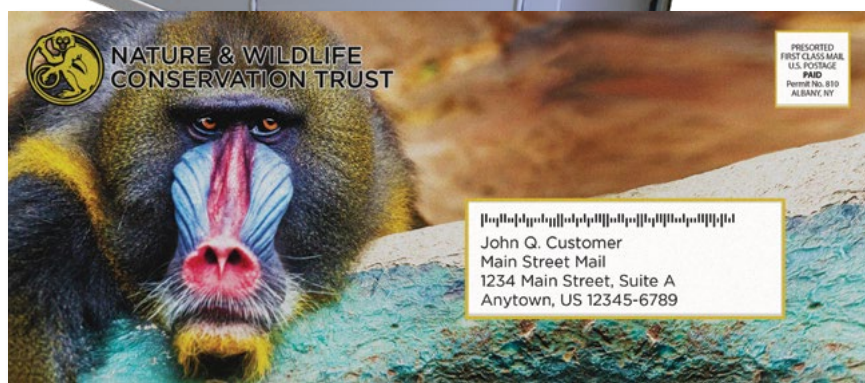
Actual scan of a full-bleed example printed on the MACH 6